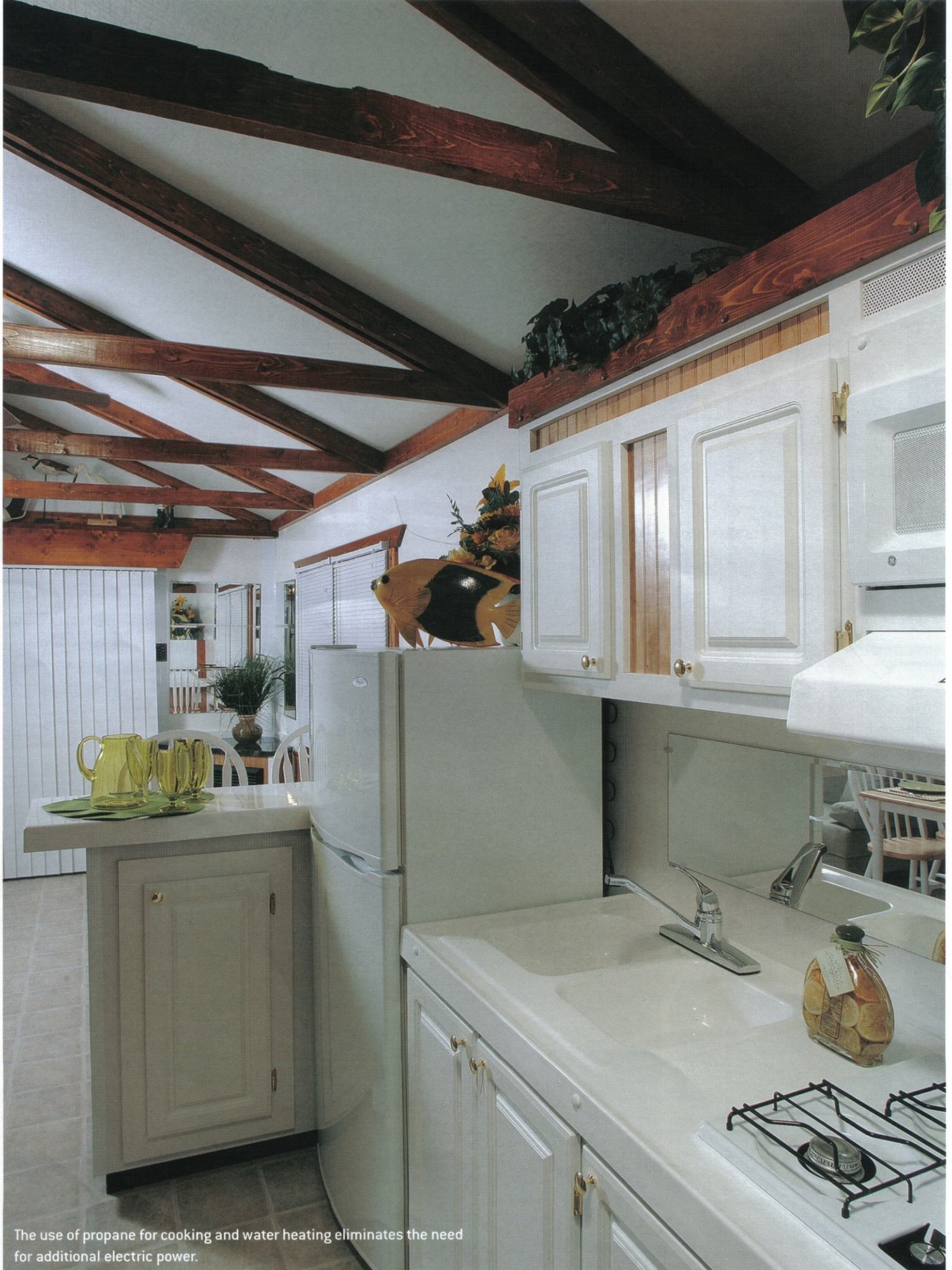
The use of propane for cooking and water heating eliminates the need for additional electric power.